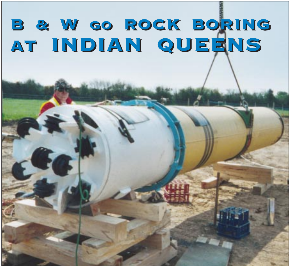
Photograph above. B&W Tunnelling have the expertise to bore through rock at quite a large diameter.

Scheme Title: Maudlin to Indian Queens Pipeline