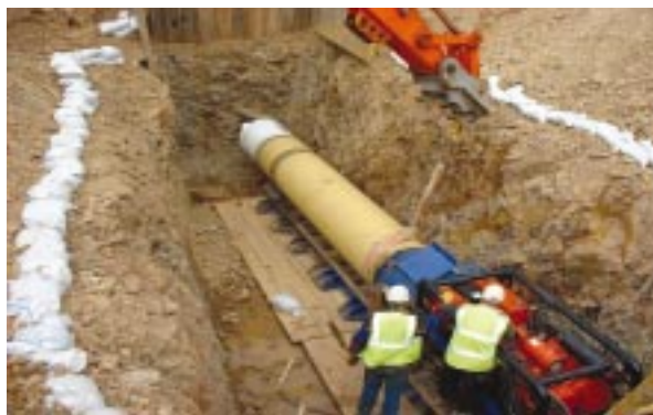
Photograph Above. Rock Boring