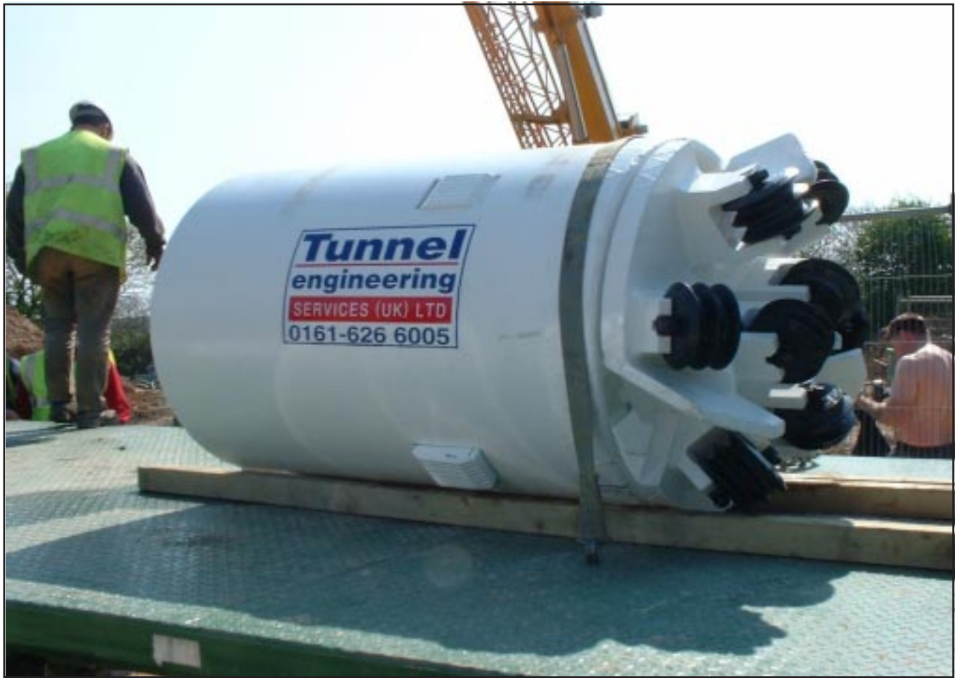
Photograph Above. The awesome Rock Boring machine supplied by TES

using a hand pipejack, we would have been “purely for economical reasons”. lucky to pull 500mm per shift.”