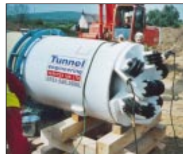
Photograph Above. The rock head was developed to handle rock up to 200MPA

railways, water-courses and woodland most always, using trenchless techniques such as microtunnelling, pipejacking or auger boring. It is here where most main contractors look to the likes of B&W to provide the works for their pipeline to tie into.