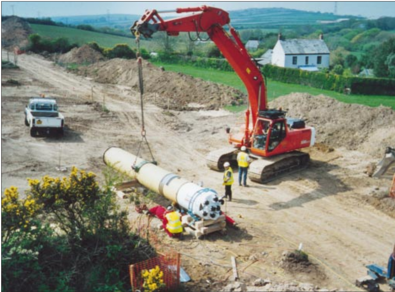
Photograph Above. Setting up for the 1 st Rock Bore which turned out to be an unprecedented success.

auger boring machinery which would make most “alleged specialist contractor” green with envy.