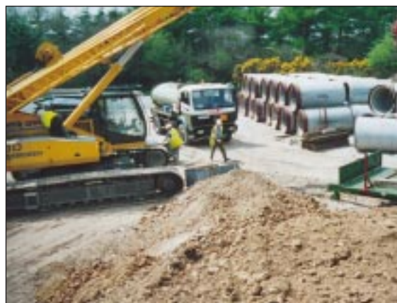
Photograph Above. The site compound set up.

It sounds relatively straightforward, but then again- where would you get a hard rock head to suit an American Augers auger boring unit?